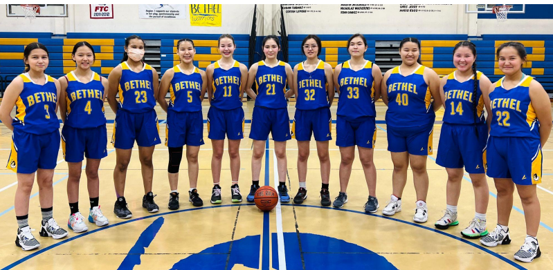
BRHS JV girls basketball team. Photo by Coach Regina Lieb.