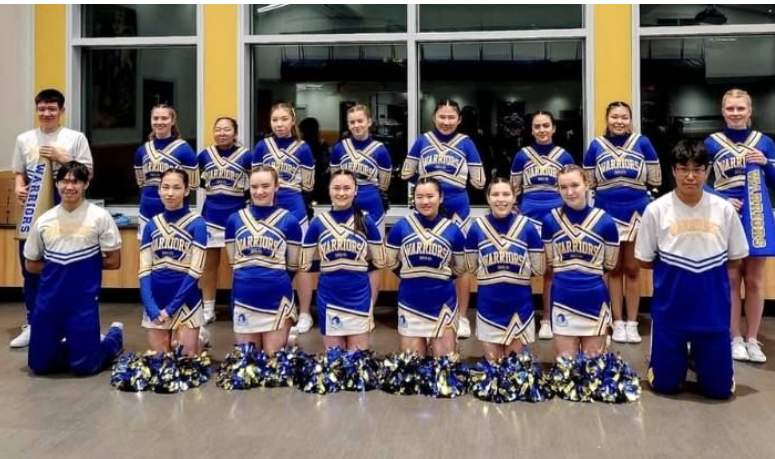
The JV and Varsity cheer squad.

On January 6-7, the BRHS cheer team cheered for the varsity boys and girls games vs. Redington. Despite not knowing all the cheers yet, they did an amazing job for it being the first time for most of the team. The season is off to a great start.