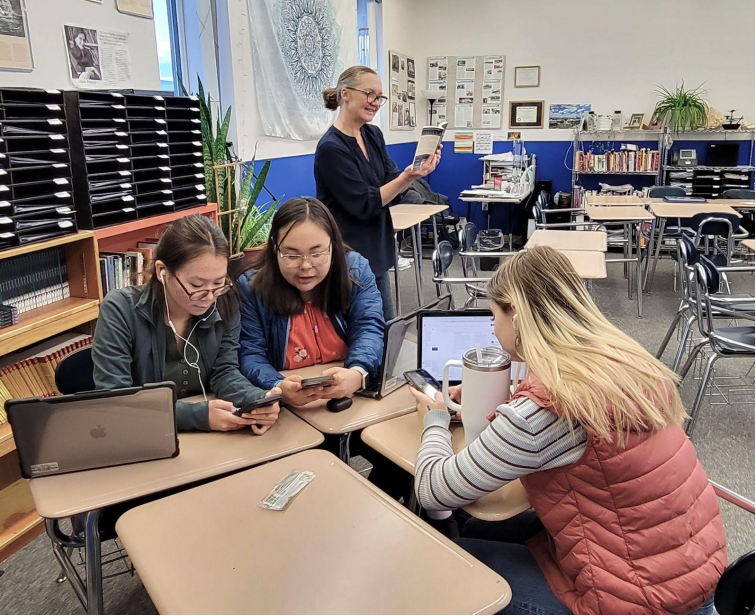
A simulation of students on their phones and earbuds during class instead of paying attention to instruction and their assignment.

Quarter three just started and some policies have changed. The policies are: phones and ear buds are to be put away during class, and when students go use the restroom they have to leave their phones in the classroom. Students can use the restroom and get water one time only per class period, and they can't be out of class longer than five minutes.