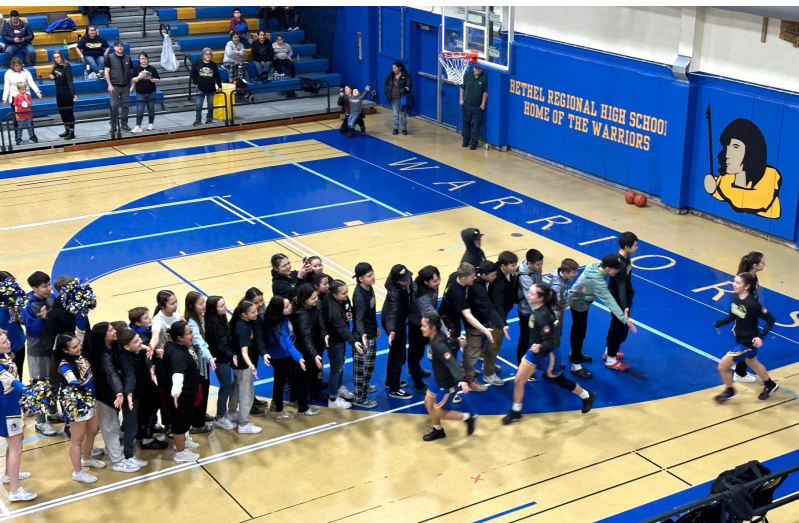
Above: the Bethel home crowd cheering on our varsity girls team. Below: The Warrior cheer team rallies the crowd.