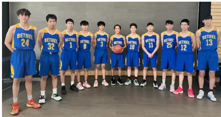
BRHS JV boys basketball team.