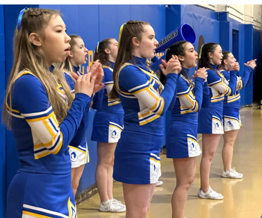
The Warrior cheer team rallies the basketball team from the sidelines.

Some of the cheers are Rise up, Go blue and gold , and Steal it, take it . This past weekend, at the JV games here in Bethel, the JV team will cheer. Let's go Warriors!